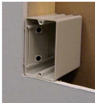
SLIDERBOX™ Installed with 1/2" Drywall

Un-like Other Adjustable Boxes, With SLIDERBOX™ There's No Need To Remove Or Relocate Mounting Screws To Re-position The Box.