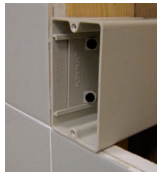
SLIDERBOX™ Adjusted for Ceramic Tile