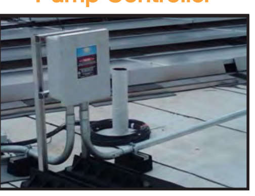
DC Combiner Box