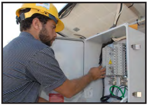
Solar Combiner Box