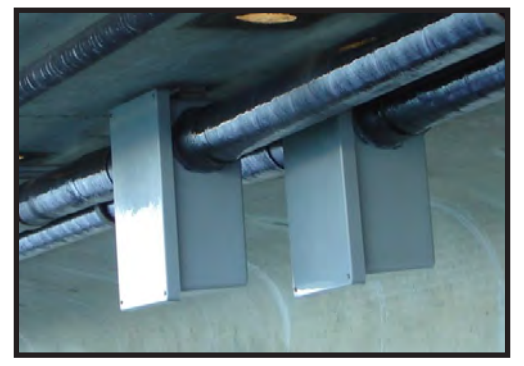
Power Junction Box