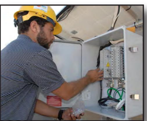
Solar Combiner Box