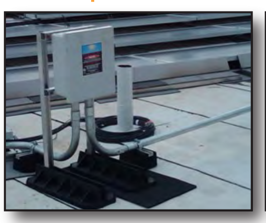
DC Combiner Box