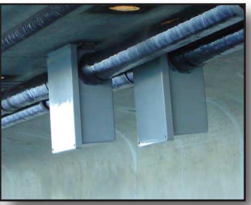
Power Junction Box