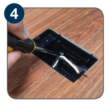
Adjust box height to achieve a flush position; wire the included device and install the gasket and cover