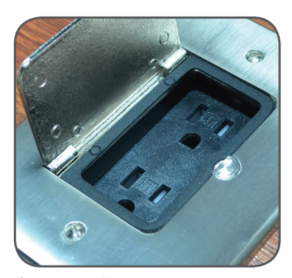
Convenient flip-lid design available in three cover finish options, along with a decorator style device.