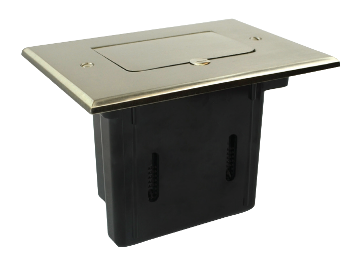
U.S. Patents #7,855,338 - #6,365,831