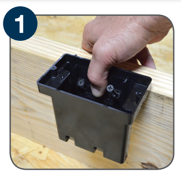
*Find and install floor box on solid floor joist; mount with slider plate in the "up" position