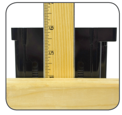
*Additional (max) substrate thickness is achieved when the slider plate is down and the box is installed at its highest position on the floor joist.