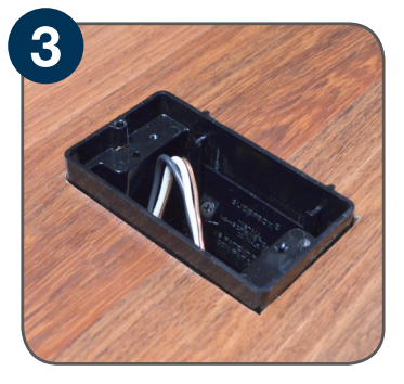
Install desired floor material around the raised floor box. The raised box allows for easier installation by contractors