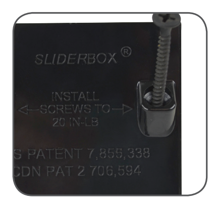
Patented slider plate holds screws in ready position, allowing for easy one-person installation.