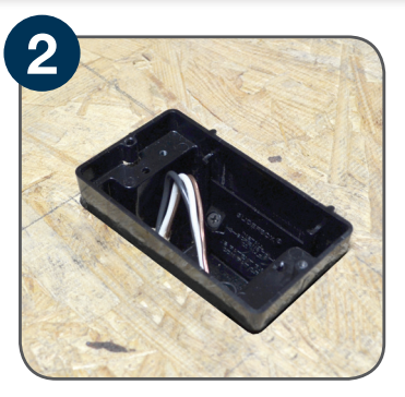
Move floor box in highest position by loosening slider plate screws, install sub floor around raised box