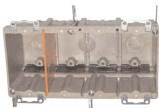
9314-EWK shown with optional LVP-1 low voltage partition installed