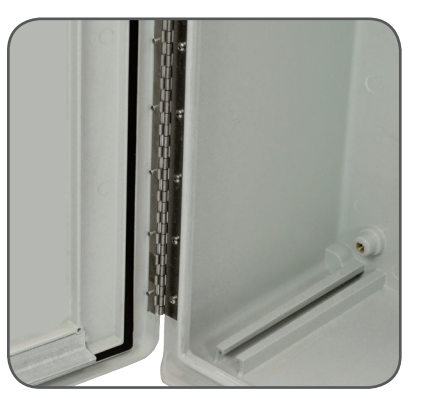
Formed-In-Place (FIP) gasket