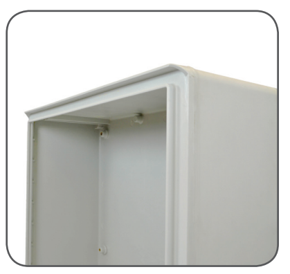
Molded-in rain guard