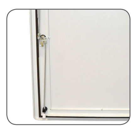
3-point latching system

The Control XL Series is a feature rich FRP enclosure that is sure to protect your components in most environmental situations. Here are just a few of those features: