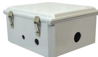
Custom Holes & Cutouts