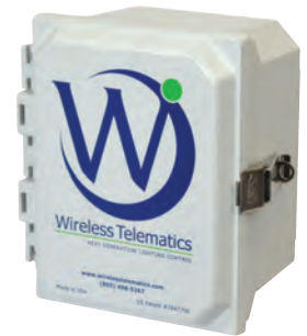
Silk Screen Printing